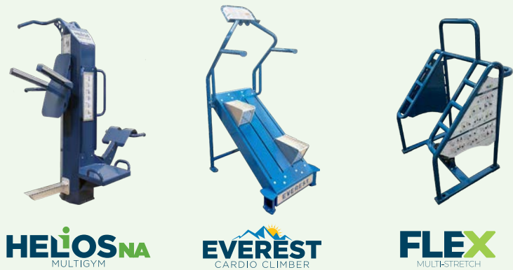
HELIOS NA MULTIGYM

Bring indoor commercial fitness equipment to the great outdoors with the Premium Fitness Package.