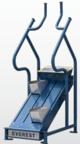
EVEREST CARDIO CLIMBER