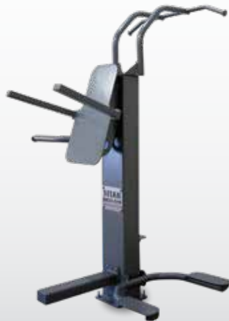
TITAN 5 STATION MULTIGYM