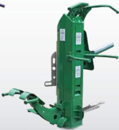
HELIOS 7 STATION MULTIGYM